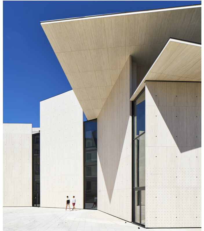
The Signe, National Graphic Design Centre, Chaumont

With its remarkable collection of antique posters bequeathed in 1906, Chaumont has made its mark as a Mecca for graphic design since the creation in 1990 of a festival and international competition that has generated a collection of contemporary posters. Now a biennial, run by Le Signe, this major event has brought together all artists and graphic designers from around the world for the past 28 years.