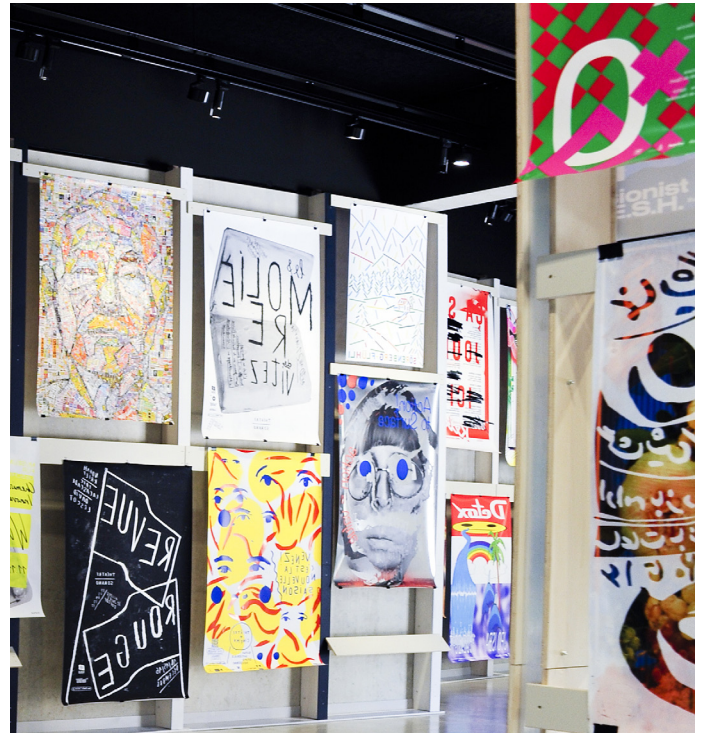
International Posters Competition exhibition, Biennial of Graphic Design 2017.